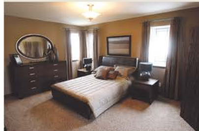
Master bedroom is well separated from the kids' bedrooms, and feature two walk-in closets.