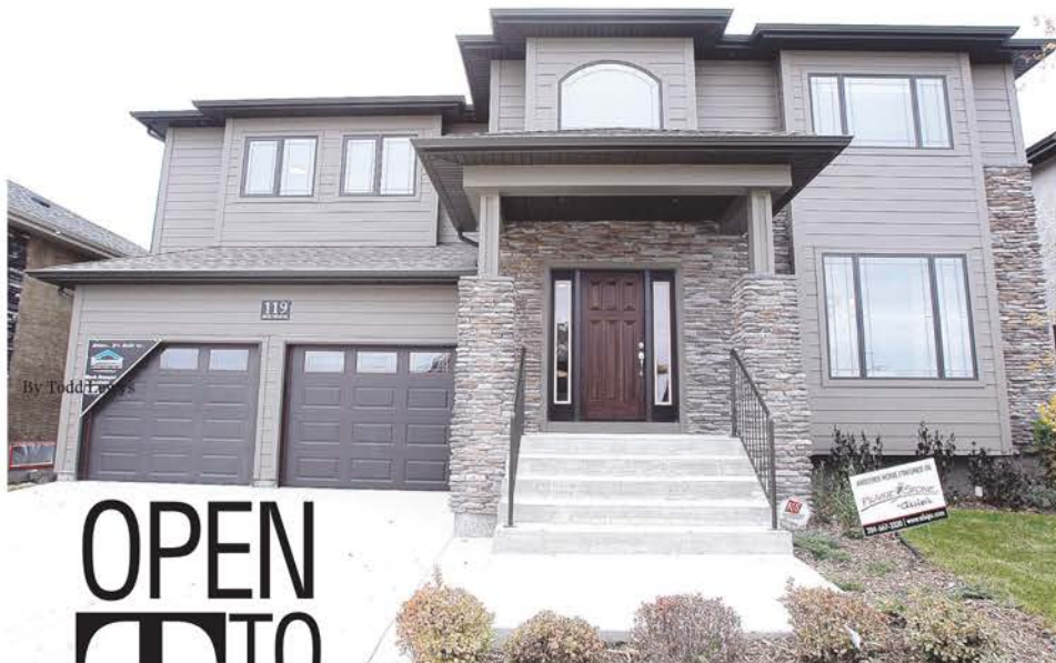
By Todd Lewis