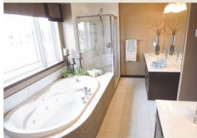
Ensuite features a large, jetted tub and separate glass shower enclosure.