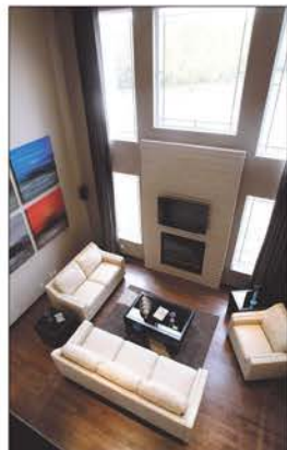
An 18-foot ceiling and full length windows make great room stunning.