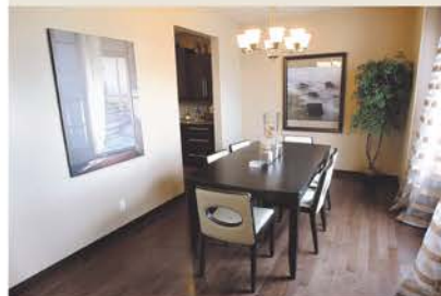
Formal dining room is separate from main living area, but it has a large entranceway for easy access.

ADDRESS: 119 Bridlewood Road, Bridgewater Forest SIZE: 2,170 sq. ft. STYLE: Two-storey PRICE: $499,900 (includes, lot, GST extra) LOT SIZE: 58' x 109' LOT PRICE: $125,000 CONTACT: Mark Rempel @ 989-5000