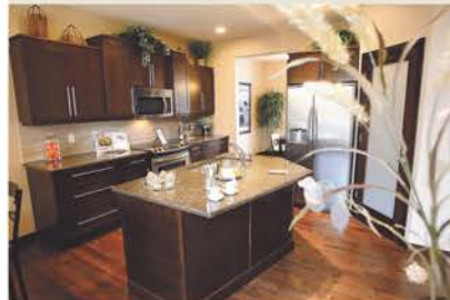
The kitchen is cozy, but it also has plenty of room to move.